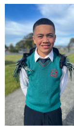
Te Ahureinga Paranihi