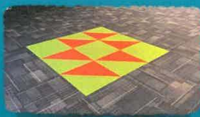
Aotea / Arawaru

Over the holidays a lot of work has taken place with construction: