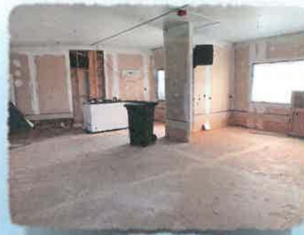
Ngā Whakaraua (Multi Purpose Room)