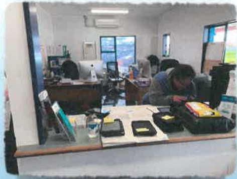
Tari / Sick Bay