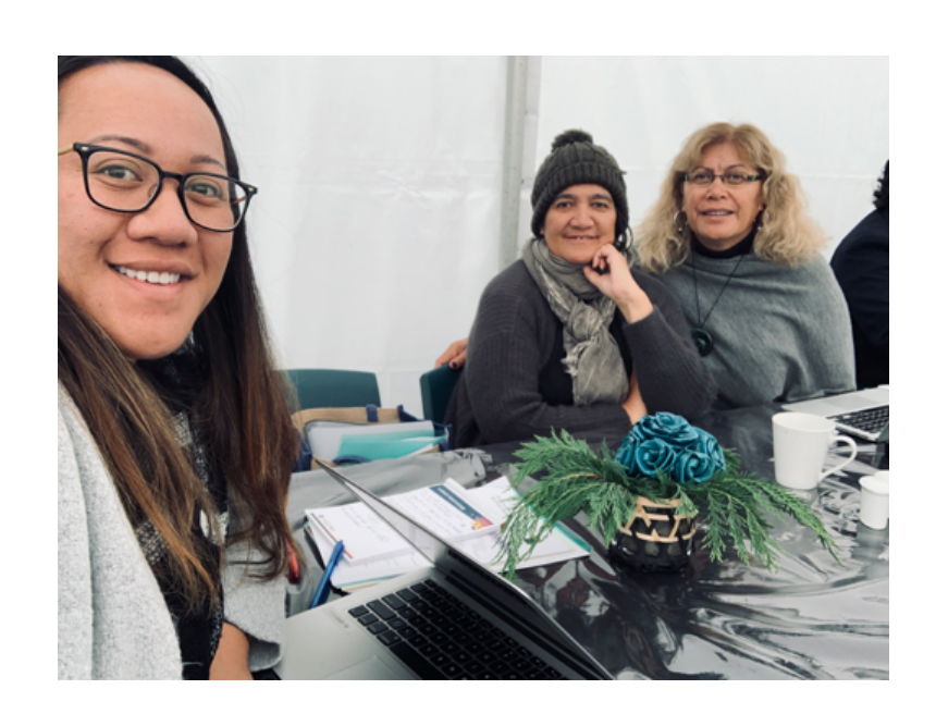
Mā Māori, mō Māori

Tau 5-8 Monday @ Manawatū Gym Sports, 93 Malden Street 12:45pm -2:30pm